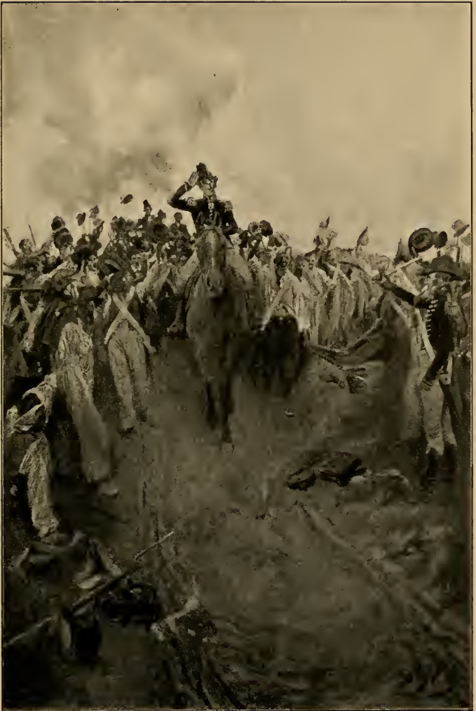
General Andrew Jackson receiving the plaudits of his army after the battle of New Orleans